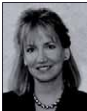
Anita Roth Family Service Mid-Peninsula Ronald McDonald House Susan G. Komen Breast Cancer Fdn. Peninsula Bridge