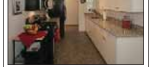
Mountain View, 3 BR/2 BA Open Sunday. Must see this beautifuly updated home ready for move-in!