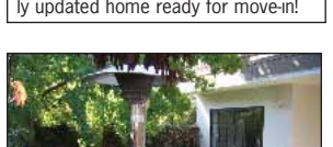
Mountain View, 3 BR/2.5 BA Price Reduced! 3 Bedroom, 2.5 Bath Townhome. Open House April 4/5, 1-4PM. www.101emiddlefieldroad7.info