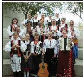
Piano Accordion Chorus Orchestra 650-722-0155

0-4 years old. Free demo class (650)561-3712 www.barvinok-us.com/bayanina.htm