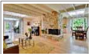
Menlo Park, 4 BR/3.5 BA West Menlo Park

Bright, airy, contemporary 4 bedroom/3.5 bath home and Sunset Magazine featured gardens. Elegant, modern architecture, integration of natural stone and wood throughout and top-of-line appointments, lots of windows looking out to park-like setting on large 12,600 lot. Chef's kitchen with Thermidor Professional range including grill and griddle, state-of-the-art appliances. Spacious, open floorplan and patio with BBQ area off of family room for easy entertaining.