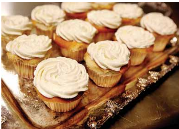
Banana cream cupcakes are topped with luscious frosting.