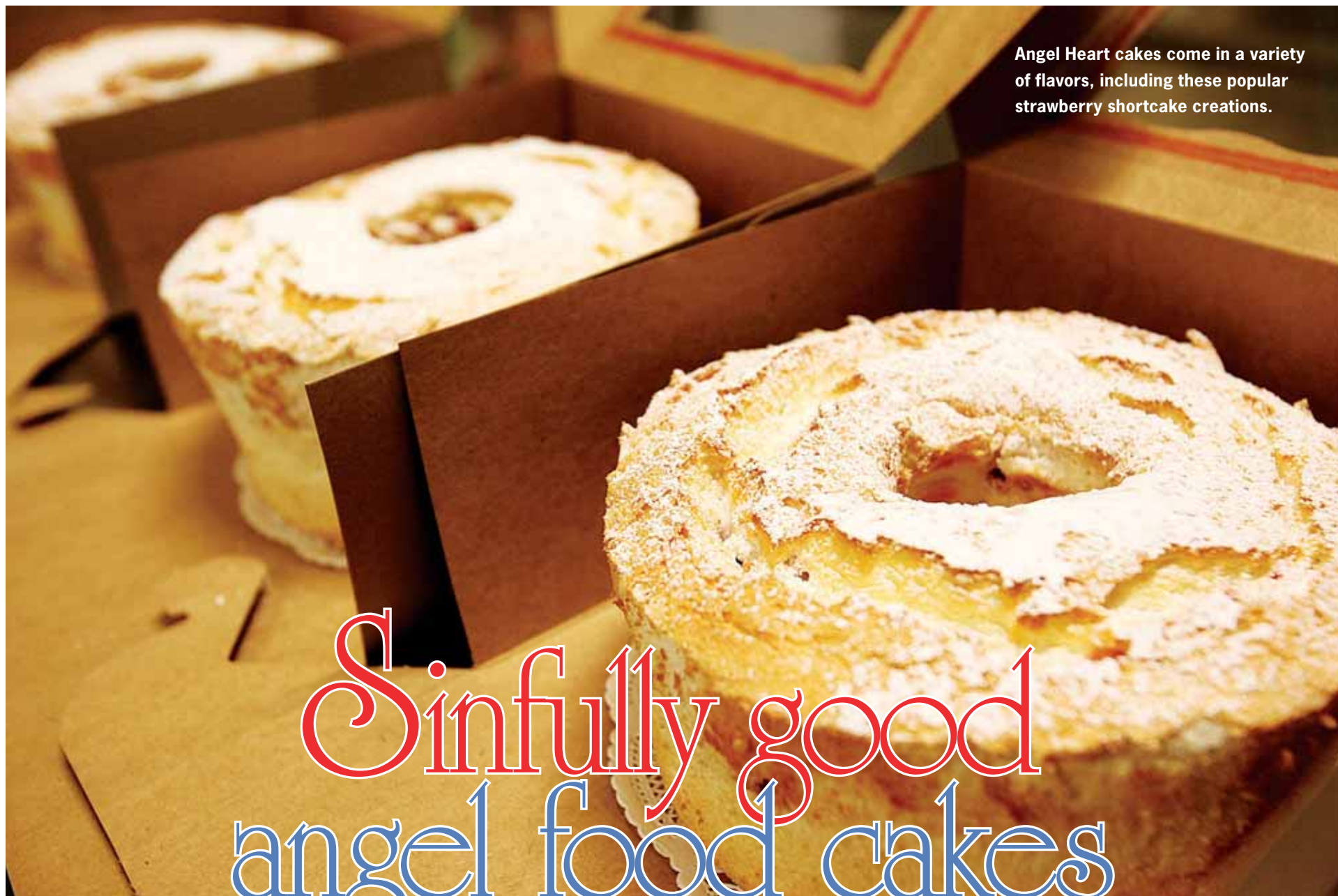
Angel Heart cakes come in a variety of flavors, including these popular strawberry shortcake creations.