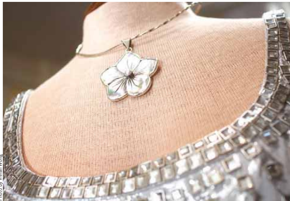
A flower necklace made with sterling silver and mother of pearl, $459 at Afterwards in Menlo Park.