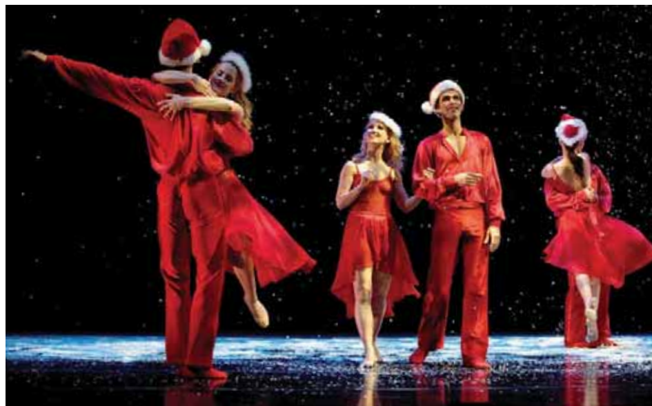
Smuin Ballet brings a holiday program to the Mountain View Center for the Performing Arts.

pira will make a guest appearance. There is no cover charge. Call 650-327-8769 or go to britishbankersclub.com .