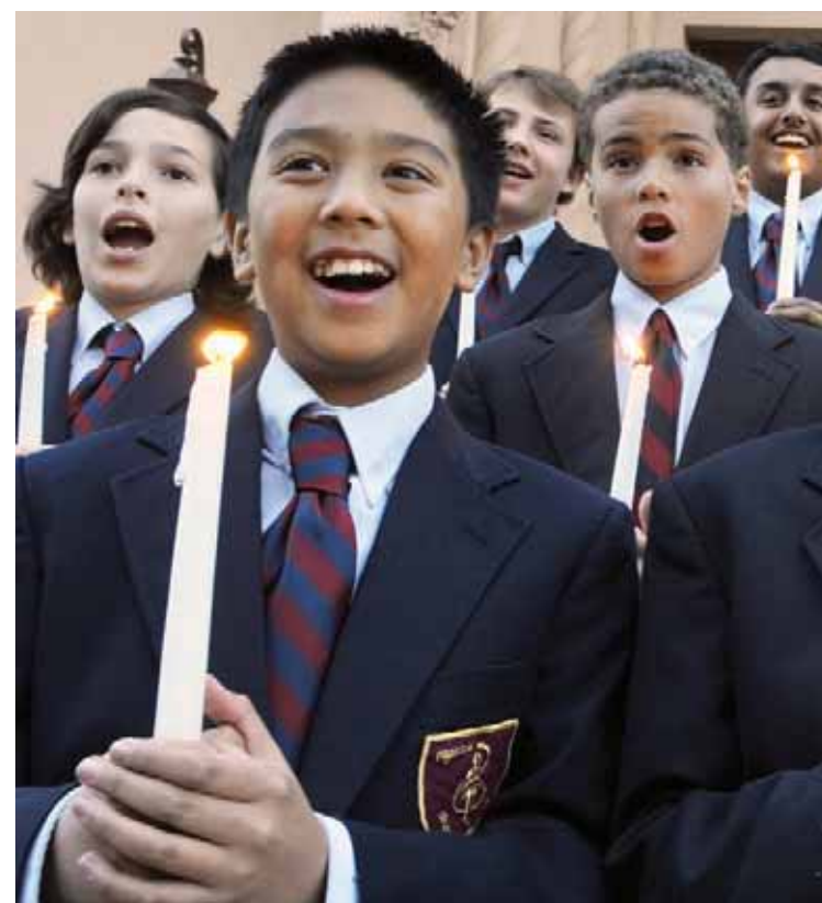
The young singers of the Ragazzi Boys Chorus will celebrate the season with a holiday concert on Dec. 4 in Palo Alto's First Congregational Church.

There's another Messiah Sing planned locally: Schola Cantorum's annual event is at the Mountain View Center for the Performing Arts at 500 Castro