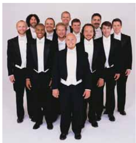
The men’s a cappella chorus Chanticleer performs a holiday concert on Dec. 9 in Stanford University’s Memorial Church.