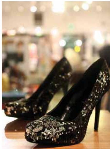
Black sequined shoes at Therapy, Mountain View.