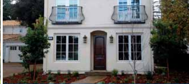
MENLO PARK 3BR | 3BA

REMODEL IN WEST MENLO $1,469,000 Home was completely remodeled in 2007 including wiring & plumbing. Beautiful large chef's gourmet kitchen opens to spacious FR. Las Lomas schools. Hossein Jalali 650.323.7751