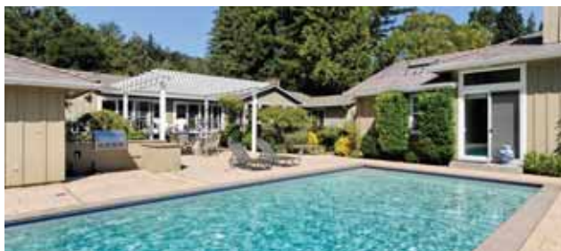
WOODSIDE 3BR | 2BA

303 OLIVE HILL LANE $5,995,000 Gorgeous home w/Chef's kitchen, living/dining w/FP, game rm, pool, tennis court, pool & guest house, 6-car garage, beautiful grounds. Karin Riley/Kris Klint 650.324.4456