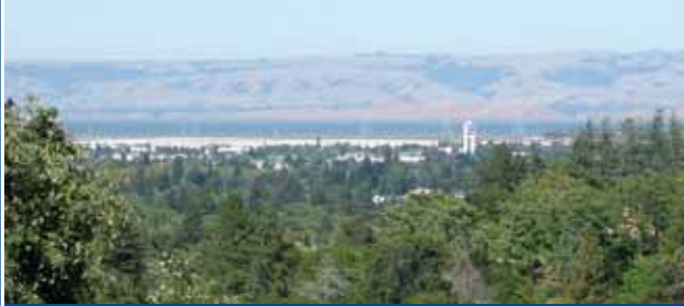
WOODSIDE 3BR | 3.5BA

GORGEOUS REMODEL $1,998,000 Elegant LR w/fireplace, formal dining room, gourmet kitchen w/granite overlooks family room. Amazing location w/ MP schools. Guest cottage w/bath. Keri Nicholas 650.323.7751