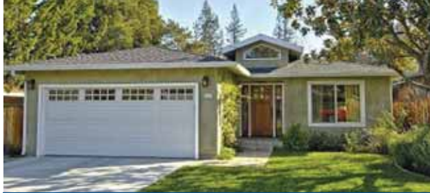
MENLO PARK 3BR | 2BA

QUIET CUL-DE-SAC $1,945,000 Stunning views, 1+ acre. Spacious contemporary on a quiet cul-de-sac! Native landscaping & solar heated pool. Great entertainment home! Judi Kiel 650.851.2666