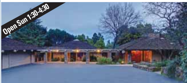
WOODSIDE 4BR | 3BA

303 OLIVE HILL LANE $5,995,000 Gorgeous home w/Chef's kitchen, living/dining w/FP, game rm, pool, tennis court, pool & guest house, 6-car garage, beautiful grounds. Karin Riley/Kris Klint 650.324.4456