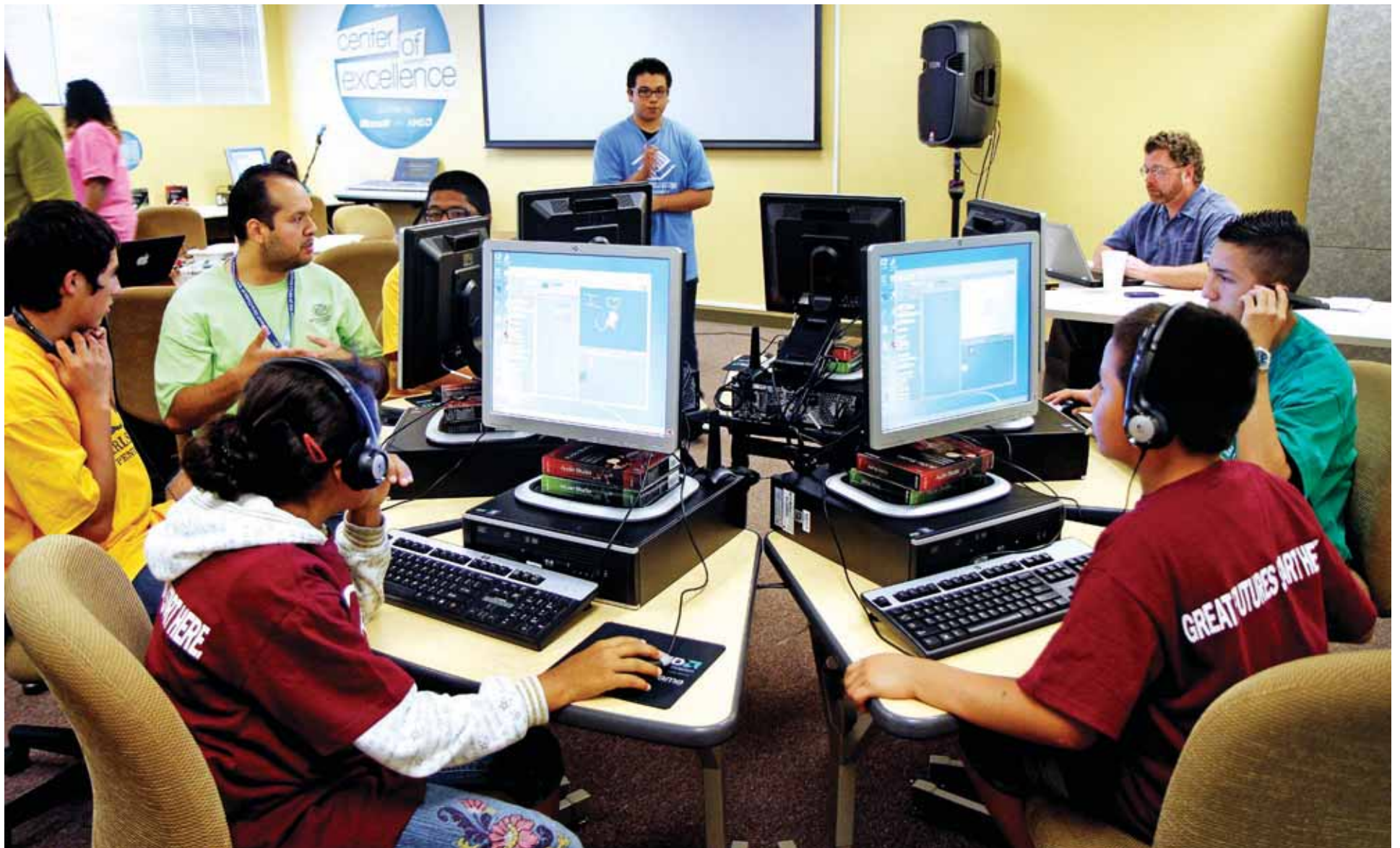
Members of the Boys & Girls Clubs of the Peninsula work on mixing music in the new tech center at the Menlo Park clubhouse.