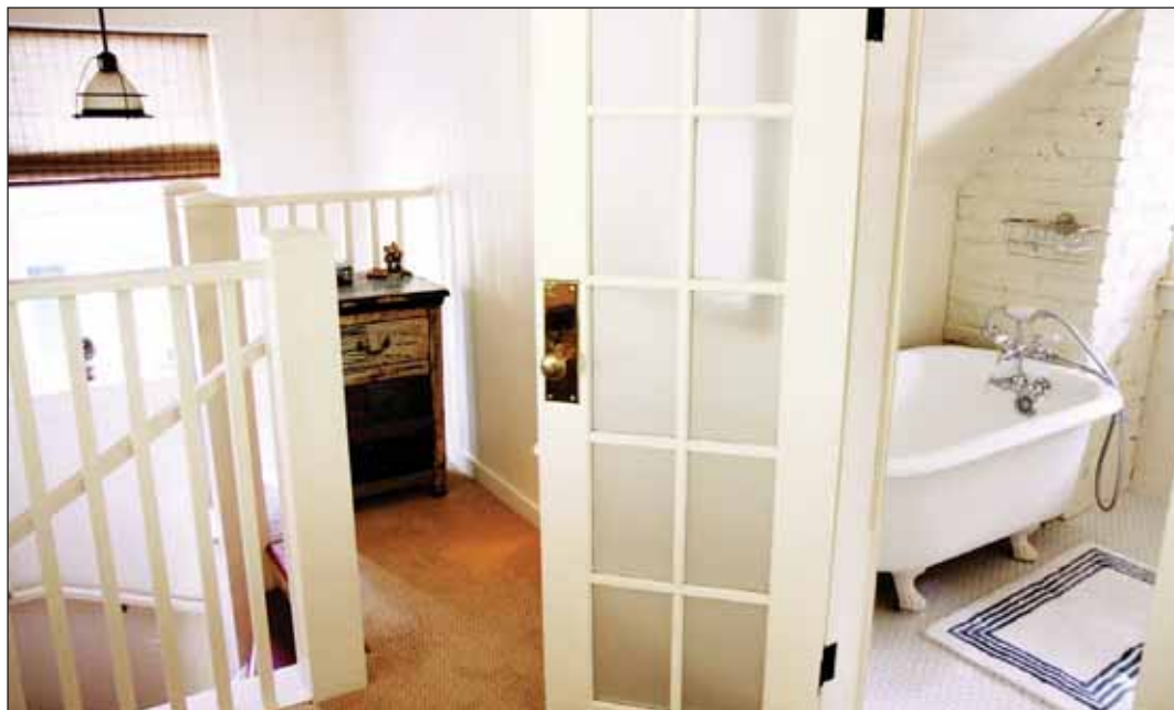
Above: Upstairs at the cabin with an old bathtub. Right: The cabin staircase.

It took nine months to remove the addition in the back, redo the dormer facing the street, fix dry rot and termite problems, and update the electrical, heating and plumbing systems.