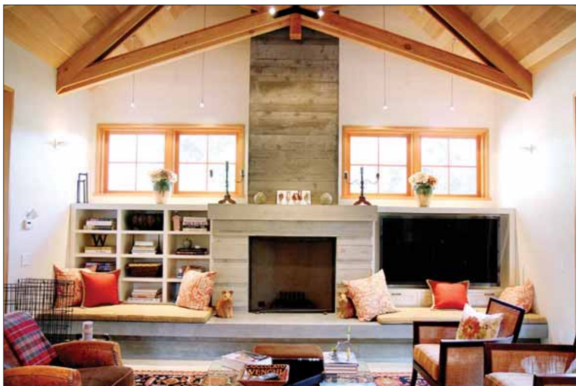
The Werbes' great room where living, dining and kitchen spaces are combined in a large open area with an 18-foot-tall ceiling crisscrossed by red cedar beams. Dominating one wall is a 25-foot-tall chimney and fireplace made out of poured-in-place concrete

"I've met more people because of the cabin. ... All have stories about playing in it," she says, exclaiming with a smile, "If the walls could talk!" ■