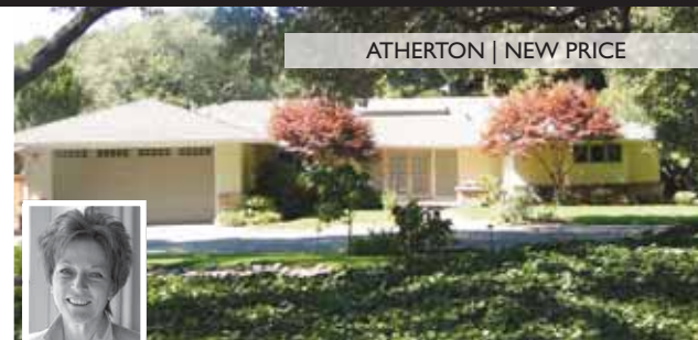
ATHERTON | NEW PRICE

459 WALSH RD $3,850,000 Architecturally significant home elevated above the street for complete privacy; amazing ceiling heights, hardwood floors, & custom detail throughout.