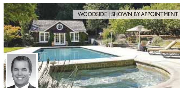
WOODSIDE | SHOWN BY APPOINTMENT

275 JOSSELYN LN $9,200,000 4BD/4BA. Almost 9 ac in Central Woodside. Exceptionally private setting with superb views & Thomas Church gardens. Opportunity to remodel or rebuild.