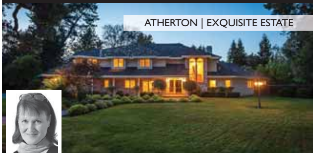
ATHERTON | EXQUISITE ESTATE