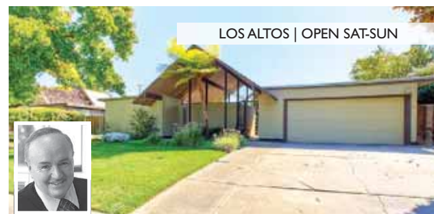
LOS ALTOS | OPEN SAT-SUN

43 FAIR OAKS LN $2,695,000 New listing! Fabulous cul-de-sac location! Beautifully remodeled 4BR/3.5BA home. Beautiful gardens. www.43FairOaksLane.com