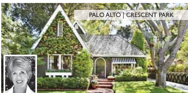
PALO ALTO | CRESCENT PARK

1674 CLAY DR $1,665,000 New Listing! Spacious atrium Eichler w/versatile 5BR + Office, 3 full baths on lovely 10,000 SF lot. Beautifully remodeled kitchen. Priced to sell.