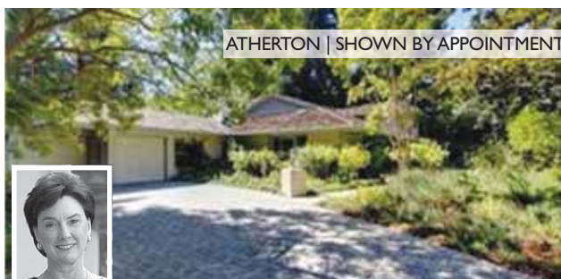
ATHERTON | SHOWN BY APPOINTMENT

49 JENNINGS $3,100,000 4bd/3ba Light-filled living rm, high ceilings, formal dining rm, gourmet kitchen, family room w/fireplace, French doors, master suite w/seating area.