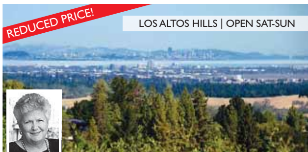
LOS ALTOS HILLS | OPEN SAT-SUN

2031 CEDAR AVENUE $2,159,000 This 4 bedroom, 3.5 bath home features elegant living room with vaulted ceilings, gourmet kitchen - Las Lomitas Schools!