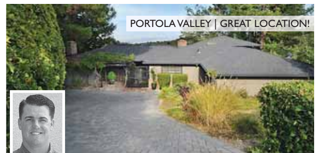
PORTOLA VALLEY | GREAT LOCATION!

21 VALLEY OAK ST $2,490,000 Scenic & Serene. Sought-after PV Ranch! From its pristine cul-de-sac, this home offers the best of this enclave's spectacular views & natural setting.