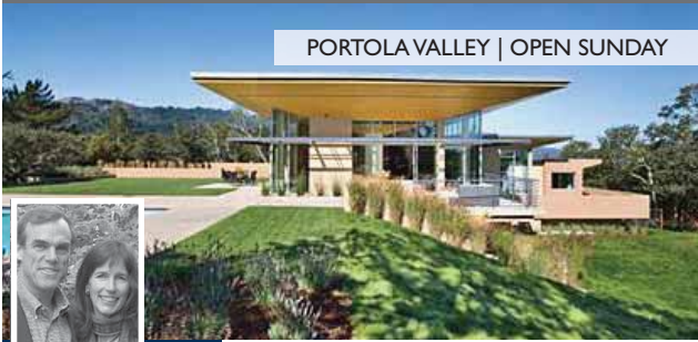
PORTOLA VALLEY | OPEN SUNDAY