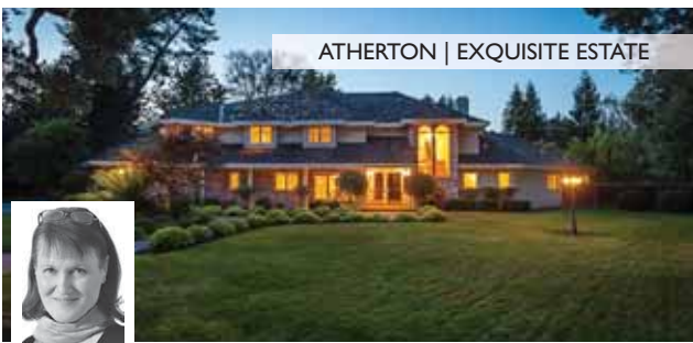
ATHERTON | EXQUISITE ESTATE

16379 SKYLINE BL $5,700,000 Gated, spectacular compound. 11+AC, 5bd/6.5ba. Infinity pool, 6+ car grg, gsthse, expansive bay vws. Dynamite landscping & outdoor entertaining space.