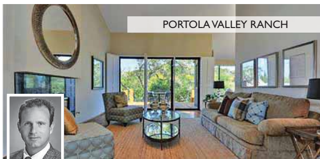
PORTOLA VALLEY RANCH

50 SIOUX WAY $3,400,000 Elegant contemporary home with Windy Hill views on private 1+ ac. with pool & guesthouse. Just min. to Stanford & excellent schools. www.50SiouxWay.com