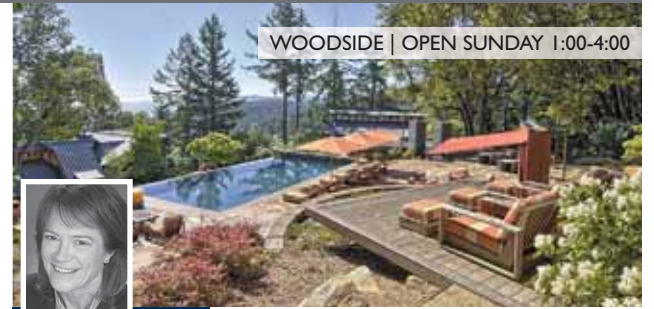
WOODSIDE | OPEN SUNDAY 1:00-4:00

320 JANE DR $6,999,000 Spacious Tri-level 5BD/4.5BA contemporary home on 6+ ac. Frml LR, Kit/FR, Library & lower level multi-purpose rm, all with views of the western hills.