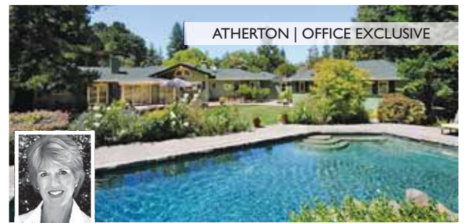
ATHERTON | OFFICE EXCLUSIVE

158 PINON DR $4,495,000 5BR, 3 full baths and 3 half baths in main house. 2-BR, 1-BA gsthse, pool/spa, cabana & solar-energy system. Approx 2.8 acres. www.158Pinon.com