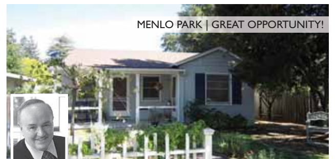
MENLO PARK | GREAT OPPORTUNITY!

27749 ALTAMONT CI $1,695,000 Custom contemp w/vaulted ceilings on priv, wooded AC. Bay views to SF5 mins to I-280, 10 mins to Los Altos or Stanford. www.27749altamontcircle.com