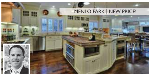
MENLO PARK | NEW PRICE!

3373 CORK OAK WY $1,795,000 Midtown Eichler. Atrium style flr plan w/2nd story added. 7BR/3BA. Family rm. Lg dining rm. LR w/FP. Original features/finishes. 2-car gar. Cul-de-sac