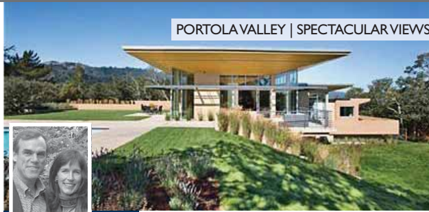
PORTOLA VALLEY | SPECTACULAR VIEWS

201 MOUNTAIN WOOD LN $29,000,000 Private and prestigious location completes this 11+ acre property located in central Woodside within walking distance to town.