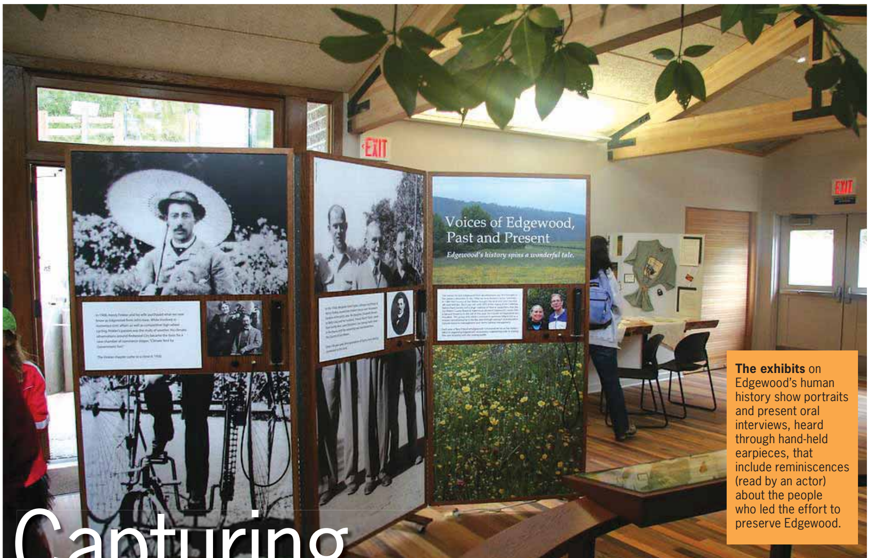
The exhibits on Edgewood's human history show portraits and present oral interviews, heard through hand-held earpieces, that include reminiscences (read by an actor) about the people who led the effort to preserve Edgewood.