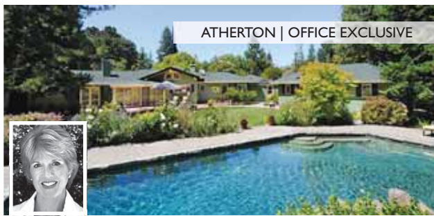
ATHERTON | OFFICE EXCLUSIVE

245 SELBY LN $4,995,000 Fantastic 5,638 SF, two-story estate on a peaceful cul-de-sac in West Atherton. Lovely private gardens w/lawn, patio, pool & tennis court.