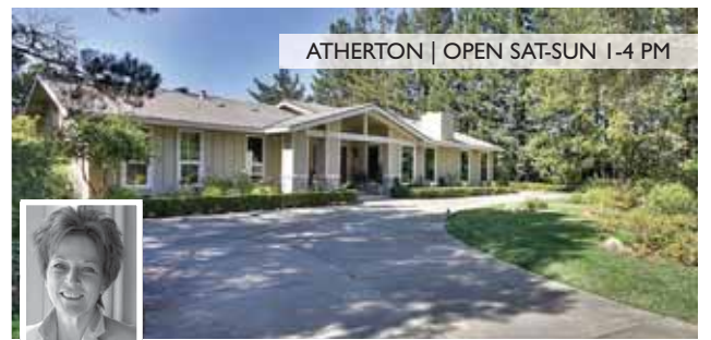
ATHERTON | OPEN SAT-SUN 1-4 PM

497 STOCKBRIDGE AVE $4,000,000 Fabulous property on 1.14 ac. 2 spacious guest houses. Enchanting Japanese Tea House completes the serene landscaping. Sparkling pool & waterfall.