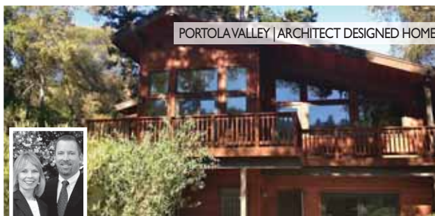
PORTOLA VALLEY | ARCHITECT DESIGNED HOME

168 HILLSIDE AVENUE $2,695,000 5BD/4.5BA, Elegant living rm, gourmet kit, exquisite mstr ste, downstairs bedroom gst suite w/secondary family rm, gorgeous craftsmanship throughout.