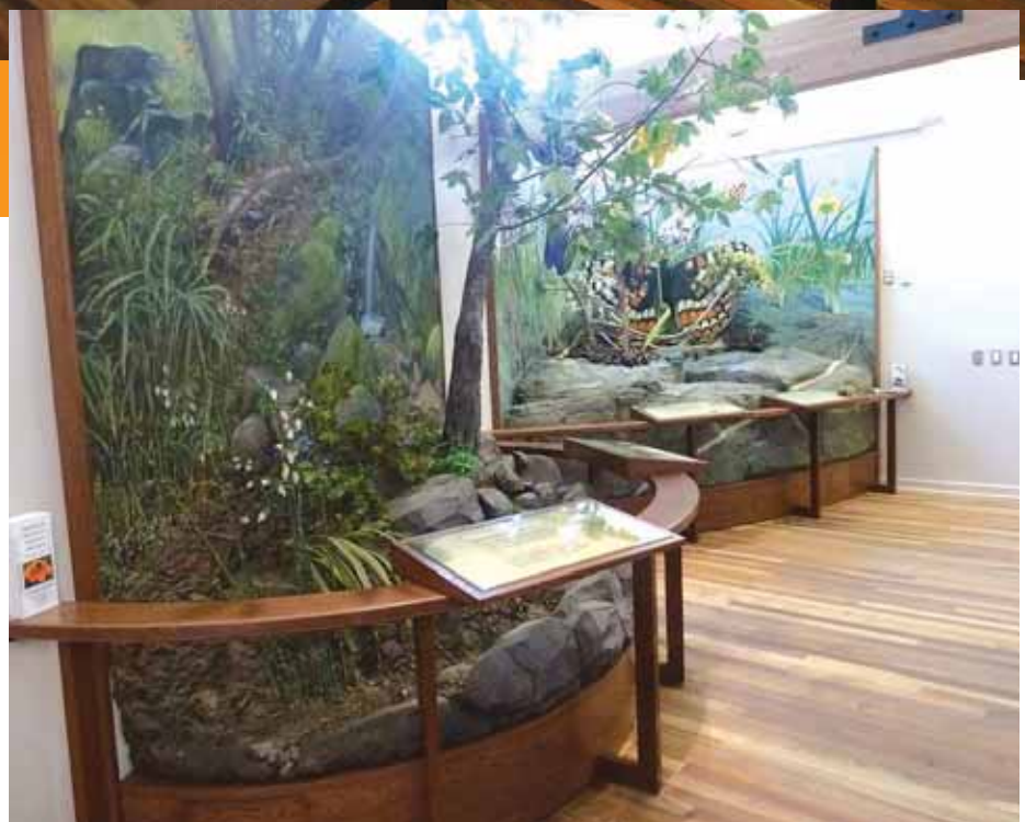
Wooden components of the education center include floors made from reclaimed shipping crates, and beams and framing made from certified sustainable sources. The windows open to the air and provide natural lighting.

That's a lot to describe using exhibits inside a building, but the Bill and Jean Lane Education Center at Edgewood