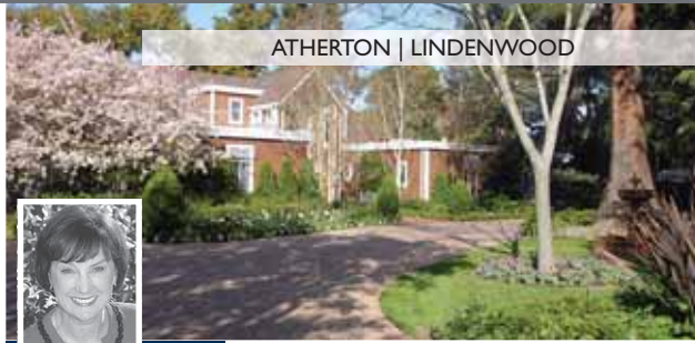
ATHERTON | LINDENWOOD

140 ELEANOR DR $7,775,000 Totally updated home with breathtaking views to San Francisco! 6BR/6.5BA home w/expanses of lush level lawn, pool, English garden, and vineyard.