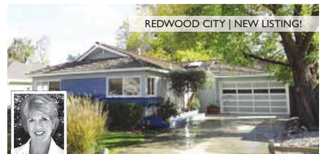
REDWOOD CITY | NEW LISTING!

580 LAKEVIEW WAY $995,000 Beautifully remodeled Emerald Hills charmer. Coffered ceiling in LR, separate DR & FR. Large 9.676 sq ft lot. Hardwood floors, French doors & windows.