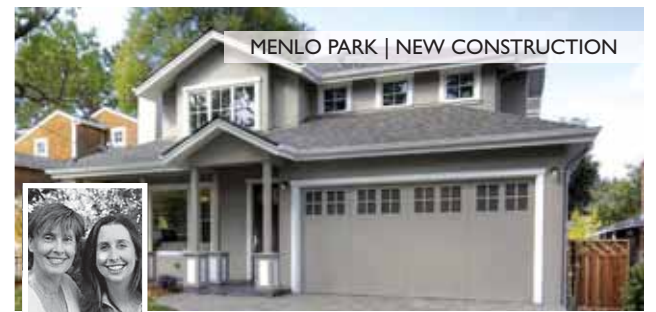
MENLO PARK | NEW CONSTRUCTION

10 ARBOL GRANDE COURT $2,995,000 Rooms of gracious proportions. Formal, yet easy flowing floor plan w/ skylights. FP in living, family & mstr bdrm. 2 suites up + main lv bdrm & bth.