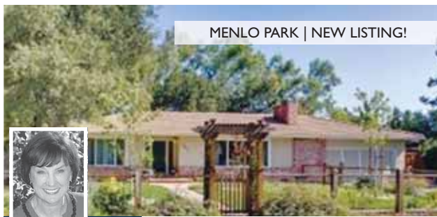
MENLO PARK | NEW LISTING!

6 MONTECITO RD $2,750,000 This hillside sanctuary is secluded and conveniently located on approximately 6 acres with sweeping views of Jasper Ridge. Visit www.6Montecito.com