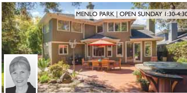
MENLO PARK | OPEN SUNDAY 1:30-4:30

3100 WOODSIDE RD $3,850,000 3 ac estate & upgraded 4BR/3BA home close to town center shops, restaurants & WDS School (pre-K to 8th); Private rolling fields, barn & rose gardens.