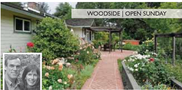
WOODSIDE | OPEN SUNDAY

2 BRIDLE LN $4,850,000 4BD/3.5BA Stunning & spacious 4940 sf contemp. home on 3.78 level ac in Central WDS. Enjoy views at the beautiful pool & garden area. www.2Bridle.com