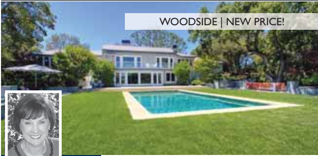
WOODSIDE | NEW PRICE!