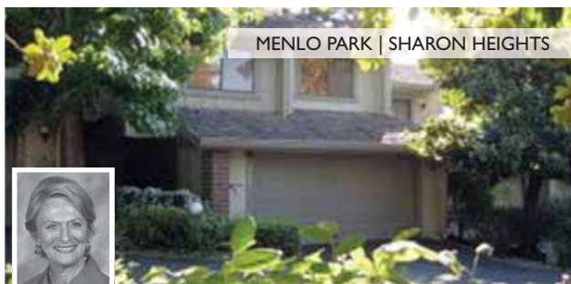
MENLO PARK | SHARON HEIGHTS

52 MORSE LN $1,595,000 Charming French Country Cottage on sunny level 1+ ac. 3BD/2BA, gourmet kit & office, pool, lovely garden areas. 4 car garage. 2 add'l storage areas.