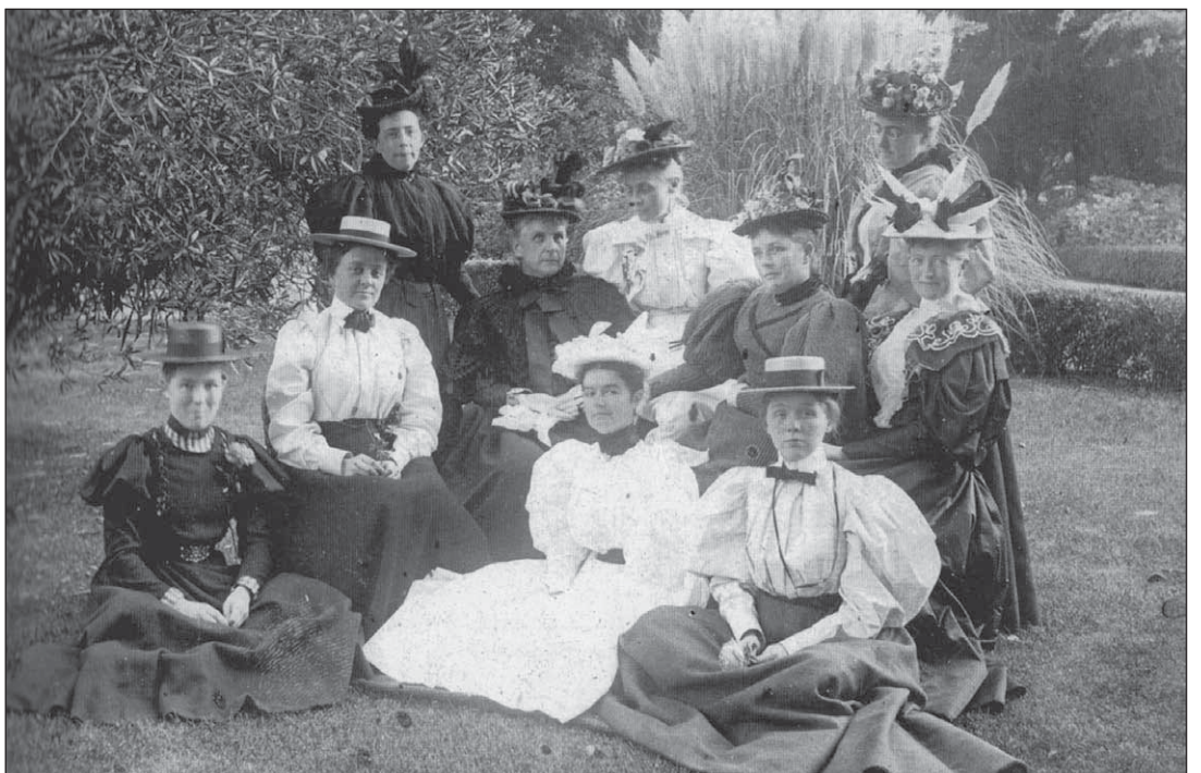
Atherton Heritage Association