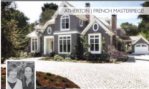
ATHERTON | FRENCH MASTERPIECE!