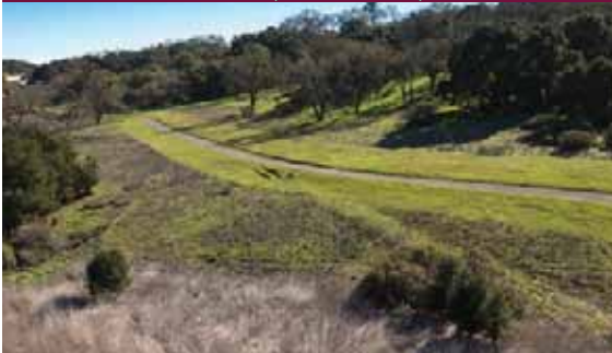
Lot 1 (15+ Acres)