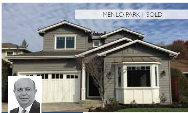
MENLO PARK | SOLD

26800 ALMADEN COURT $3,499,000 Stunning Bay views from this gorgeous 1 AC+ property w/PA schools. Contemporary 4bd/3ba, gourmet kitch w/sub zero refrig. Mbr with private deck.