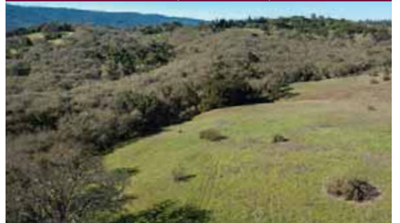
Lot 3 (22+ Acres)