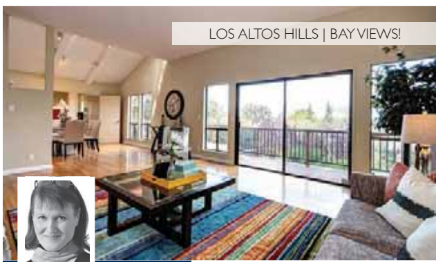
LOS ALTOS HILLS | BAY VIEWS!

90 ALMENDRAL AVE $4,995,000 Wonderful opportunity to build your dream home in desirable West Atherton location.