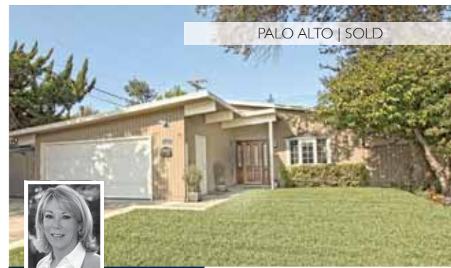
PALO ALTO | SOLD

601 FARMIN RD $1,199,000 Turnkey 3BD/2BA country hm w/open flrpln, high clngs, loft & attached 2 car grg. Pasture for horses/farming. Fenced grdn. Aprx 3.6 ac. Det. shop/grg.