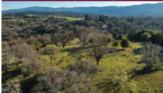
Lot 4 (22+ Acres)