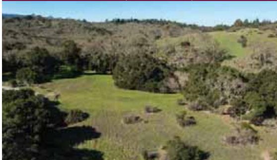
Lot 2 (15+ Acres)