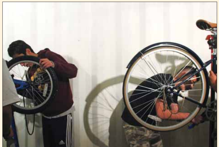
All the current students at Belle Haven Bikes attend Menlo-Atherton High School. The class is free for members of the Boys & Girls Club.