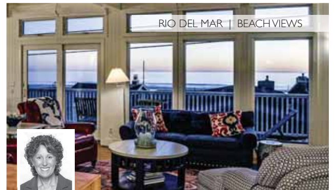
RIO DEL MAR | BEACH VIEWS

812 LA MESA DR $2,690,000 Spacious 4 bedroom, 4 bath Ladera home with office, media room and rec room. Spectacular View and excellent schools. 812LaMesa.com