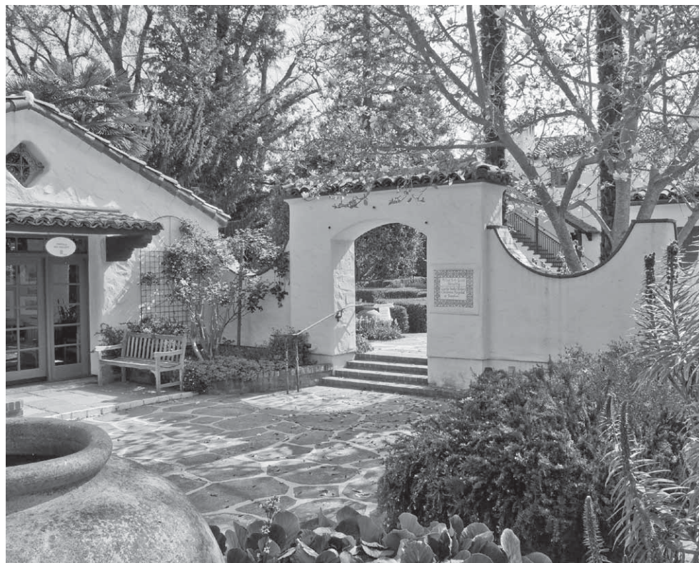
At the top is a 1931 Ansel Adams photograph at Allied Arts Guild. The building at the left is now occupied by the Portola Art Gallery. Below the Ansel Adams photo is the 2010 rephotograph by Alan McGee of Portola Valley. The area looks much as it did with the exception of landscaping, an added cover to the building's entrance, and the addition of tile trim to the top of curved sections of the wall.