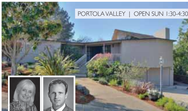
PORTOLA VALLEY | OPEN SUN 1:30-4:30

75 BELLE ROCHE AVE $3,295,000 5,700 sq ft Mediterranean estate on "private gated" street! World class views w/ pool/spa, gas fire pit, outdoor kitchen/bar all on huge deck!!!