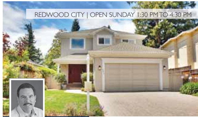
REDWOOD CITY | OPEN SUNDAY 1:30 PM TO 4:30 PM

2240 CAMINO A LOS CERROS $2,495,000 Tranquil & renovated retreat from the busy lifestyle. Chef's kitch w/ bkfst area, DR & spacious FR overlook a private oasis w/ lawn & lush gardens.