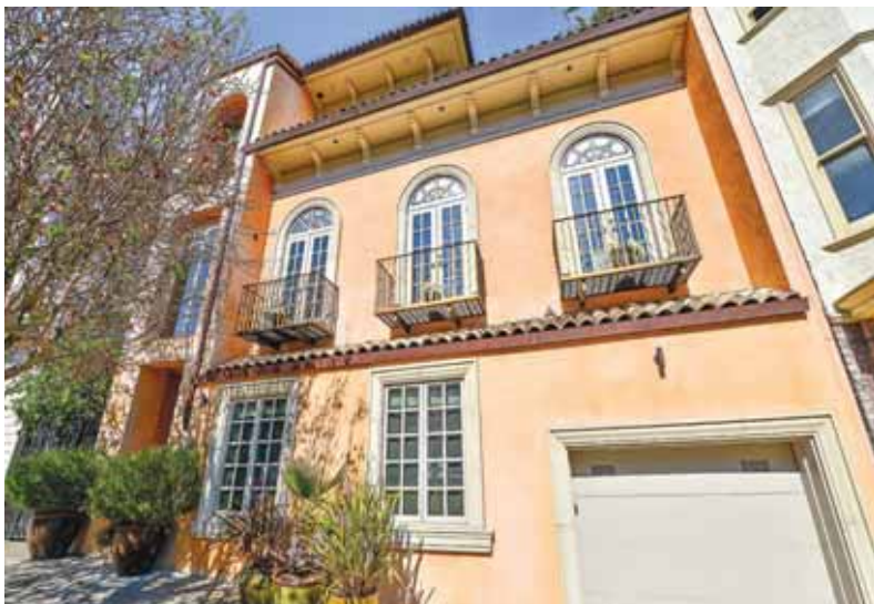
SAN FRANCISCO $6,200,000