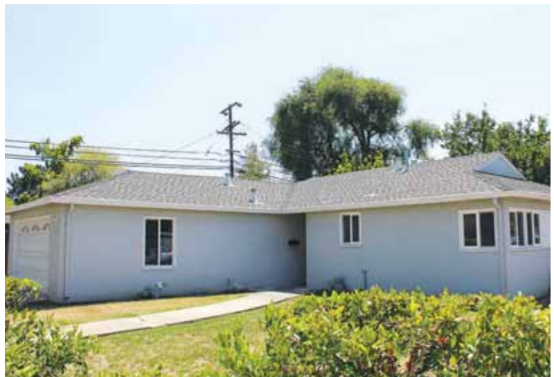
REDWOOD CITY $1,050,000

145-147 Alpine Terrace | 6bd / 5.5ba Ken Glidewell | 650.462.1111