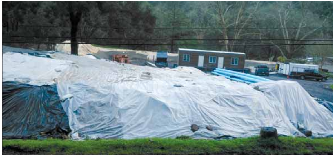
This massive pile of tarp-covered soil, the result of a basement excavation on Greer Road in Woodside, has been sitting next to the road all winter. The excavation itself is behind the portable trailer in the photo.

The proposed ordinance would have allowed 50 percent of a basement to extend beyond the footprint of the enclosed structure above it. After extensive discussion, the council, on a 5-2 straw vote, recommended to staff to increase the area of basement