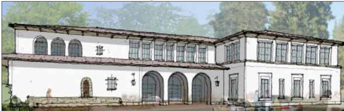
Drawing by WRNS Studio/Courtesy town of Atherton

By contrast, the library, sited close to the current library's location, is of a sleek modern style with lots of curves and a flat roof. The existing historic town council chambers will be retained and renovated as an auxiliary to the library. The site plan shows more than