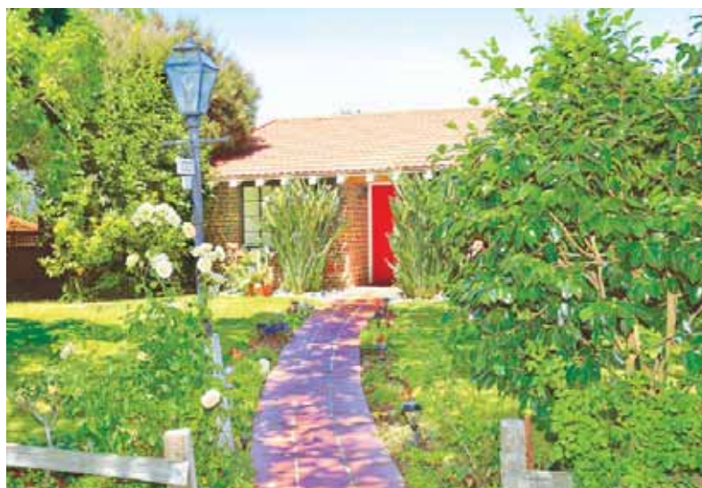
MENLO PARK $2,365,000

50 Cornell Avenue | 4bd/4ba Mara McCain | 650.462.1111