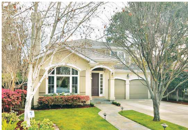
PALO ALTO $4,795,000