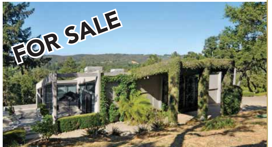
WOODSIDE OFFERED AT $6,399,000