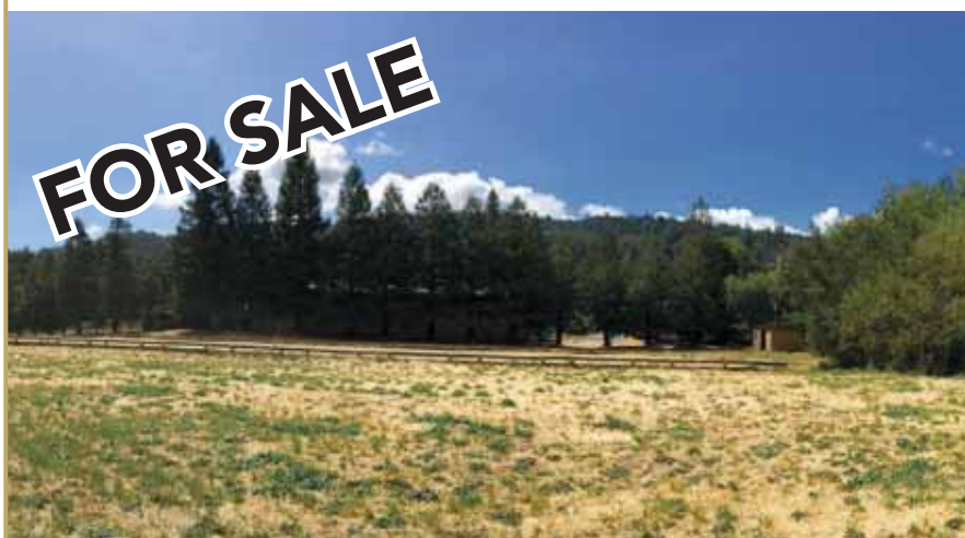
WOODSIDE OFFERED AT $13,900,000