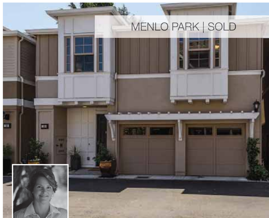
MENLO PARK | SOLD

399 Atherton Ave $5,495,000 Updated home w/ 5,000+ sf living space. Contemporary country home in a serene tree setting. 5/4.5, study, FR, + 1 bd/1ba remodeled guest house.