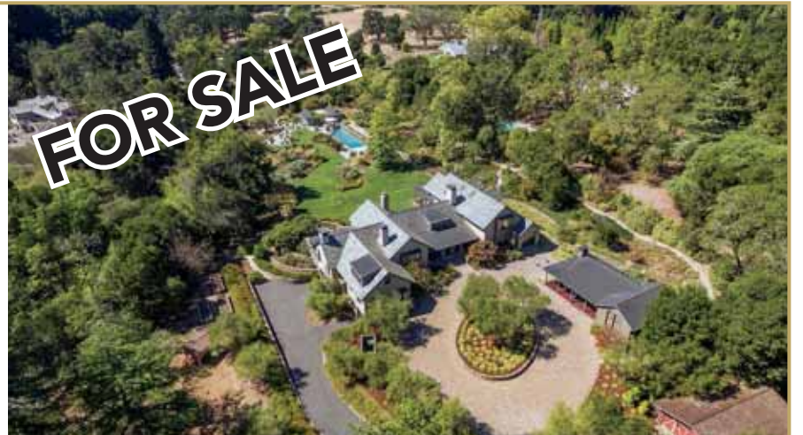
WOODSIDE OFFERED AT $24,500,000