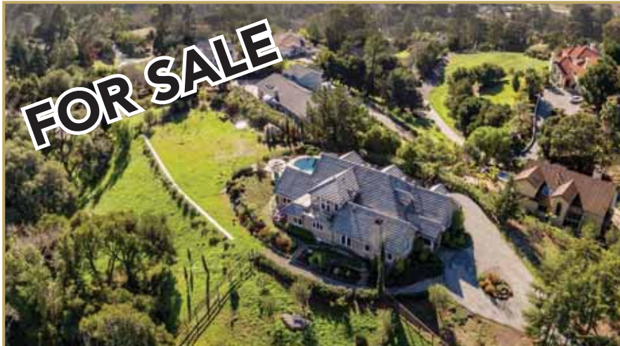
WOODSIDE OFFERED AT $4,650,000