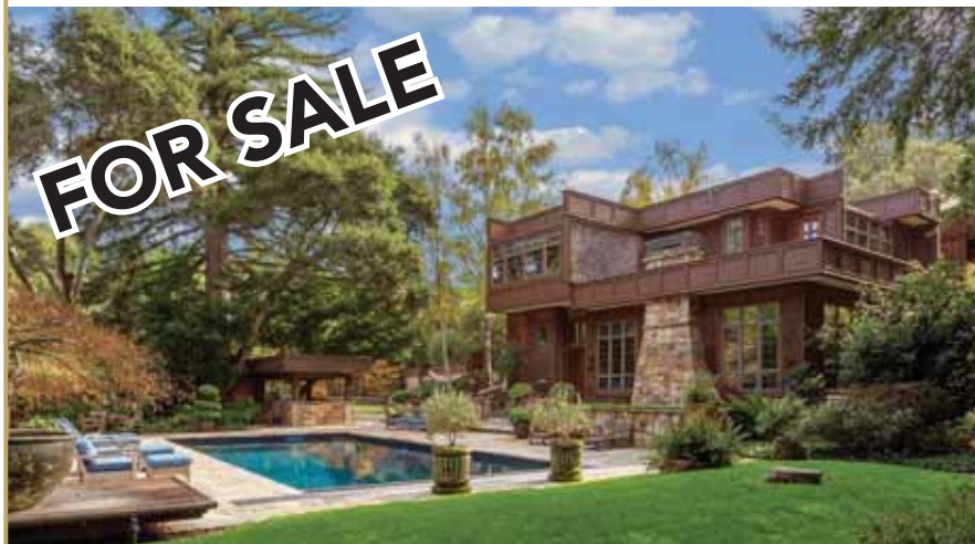
WOODSIDE OFFERED AT $21,500,000