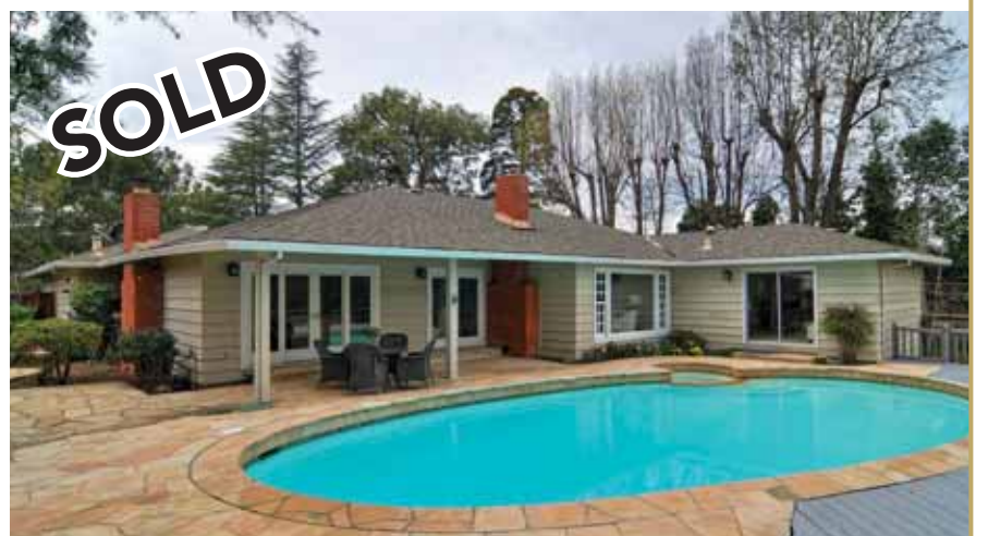
PORTOLA VALLEY OFFERED AT $2,995,000