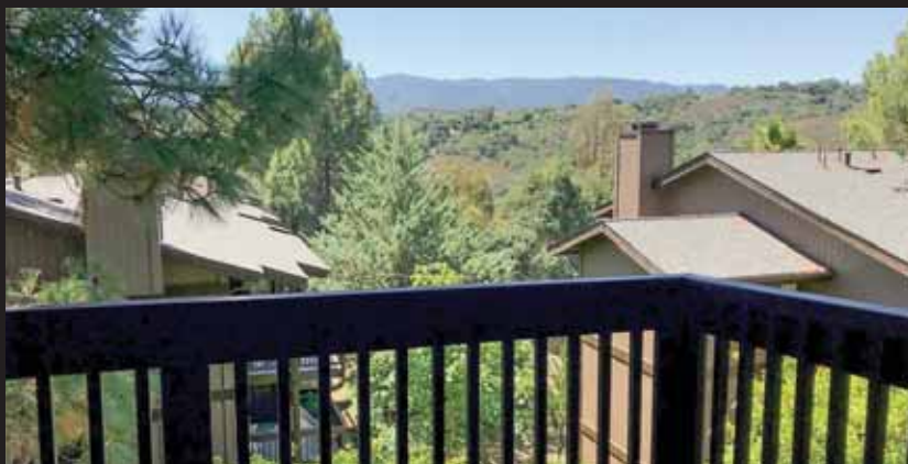
3338 La Mesa Drive #5, San Carlos $1,145,000 3 Bed | 2 Bath

Vicky Costantini 650.430.8425 | DRE 01498092 vicky.costantini@compass.com