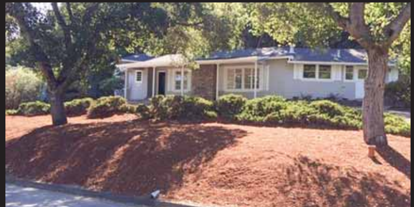
1835 Cordilleras Road, Redwood City $1,829,000 3 Bed | 2 Bath

Maggie Heilman 650.888.9315 | DRE 01206292 maggie.heilman@compass.com