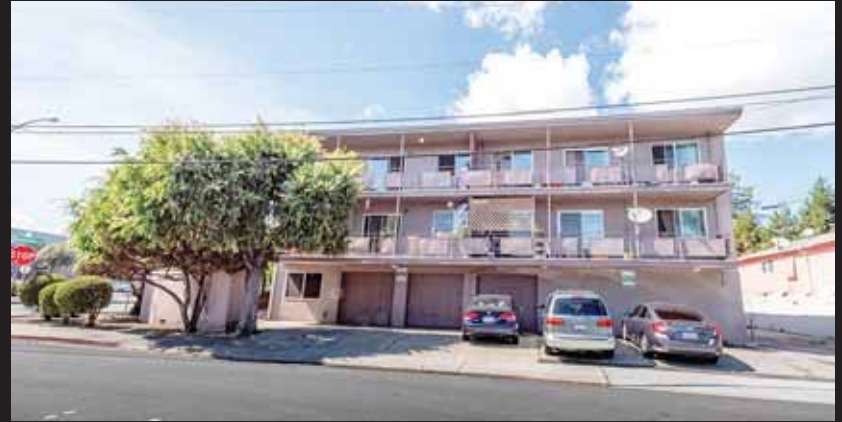
2483 Middlefield Road, Redwood City $5,650,000 15 1 Bed | 1 Bath units

Liz Daschbach 650.207.0781 | DRE 00969220 liz.daschbach@compass.com