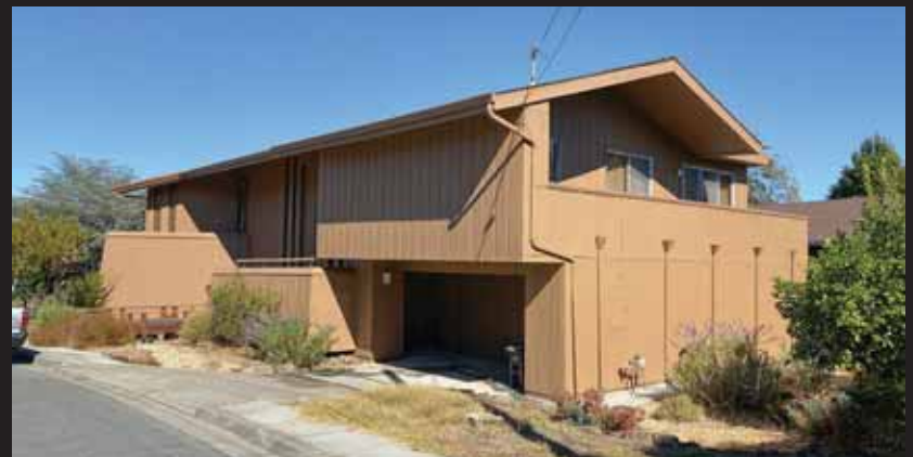
845 Shepard Way, Redwood City $1,800,000 4 Bed | 3 Bath

Katy Thielke Straser 650.888.2389 | DRE 01308970 katy@compass.com