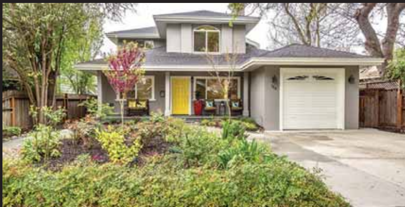
789 16th Avenue, Menlo Park $1,890,000 4 Bed | 3 Bath

Chris Anderson 650.207.7105 | DRE 01438988 canderson@compass.com