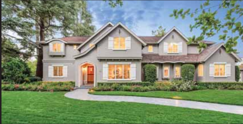
77 Serrano Drive, Atherton $10,695,000 6 Bed | 6.5 Bath

Access thousands of new listings before anyone else, only at compass.com .