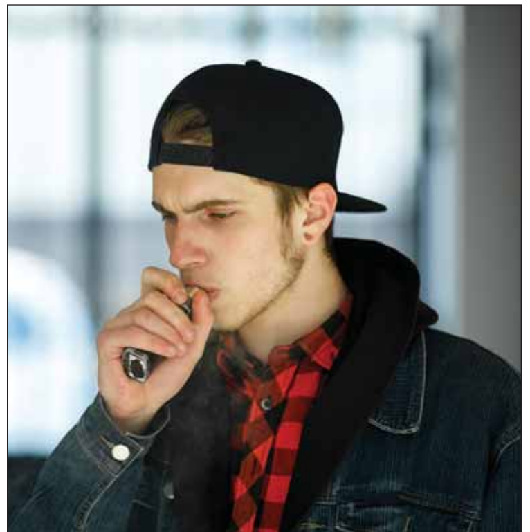
Local jurisdictions have passed restrictive measures in an attempt to curb vaping among youth. Menlo Park is the latest to consider an ordinance limiting flavored tobacco sales.

“Our engagement with the BSUs led to them choosing to complete a social justice oriented-tobacco education project,” she said. “The project included peer-to-peer education activities, a youth-designed social media