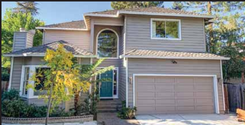
8 Sequoia Court, Redwood City $2,195,000 4 Bed | 2.5 Bath

Vicky Costantini 650.430.8425 | DRE 01498092 vicky.costantini@compass.com