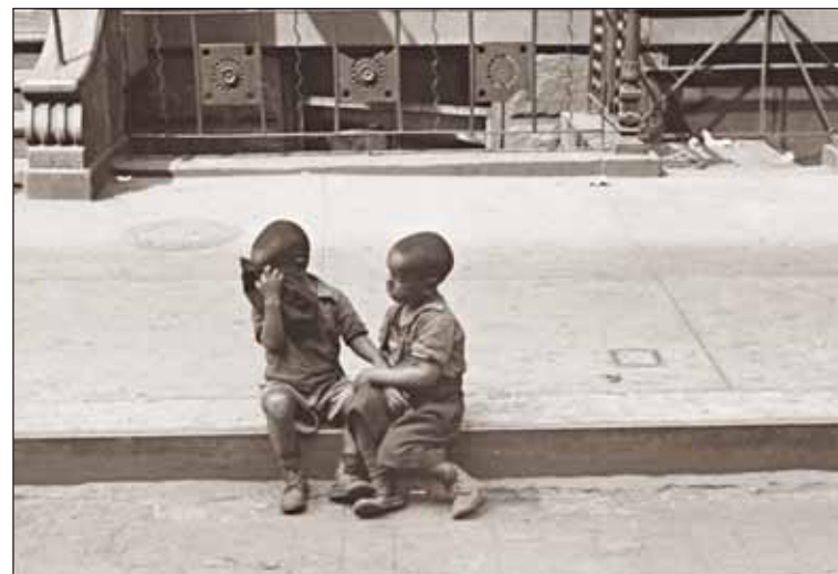
c. 1940, from the photography collection at Stanford University.

Until the center closed earlier this month because of the coronavirus threat, it featured an exhibition, “Outside Looking In: John Gutmann, Helen Levitt and Wright Morris,” in the Ruth Levison Halperin Gallery. The exhibit was scheduled to continue until April 26. (The date of the center’s reopening, and when the exhibition might be rescheduled, is unknown at this time.)