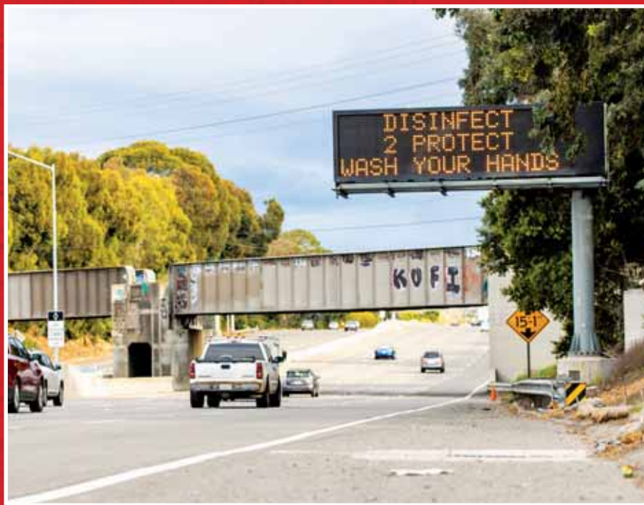
Above, An electronic marquee reads “DISINFECT 2 PROTECT WASH YOUR HANDS” along southbound Highway 101 in Menlo Park by the Willow Road exit during commute time on March 17. At right, a medical professional speaks to a driver by a testing tent in Menlo Park that closely resembles COVID-19 testing drive-thrus throughout the Bay Area. Signage around the lot indicates the testing site is run by Stanford Health Care. Stanford did not confirm whether this site is being used to test people for COVID-19.