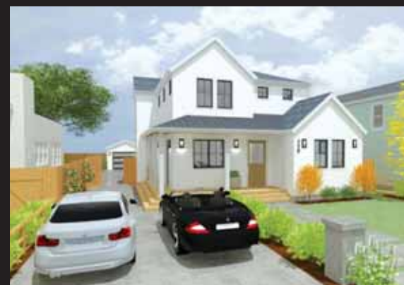
330 Grand Street, Redwood City 5 Bed | 3.5 Bath | Price Upon Request compass.com