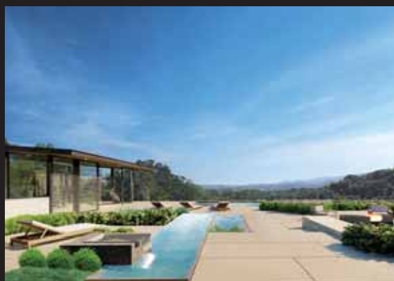
385 Westridge Drive, Portola Valley Lot | 3.2+ Acres | $5,995,000 385westridge.com