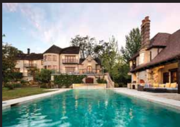
40 Fox Hill Road, Woodside 6 Bed | 6 Bath | $8,995,000 exceptionalwoodsideestate.com

Access thousands of new listings before anyone else, only at compass.com .