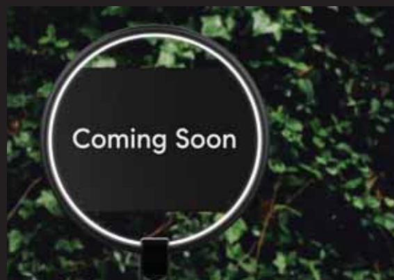
000 Jefferson, Woodside 0 Bed | 0 Bath | $299,000 margotandricky.com

Deborah Kehrberg 650.888.6558 DRE 01131900