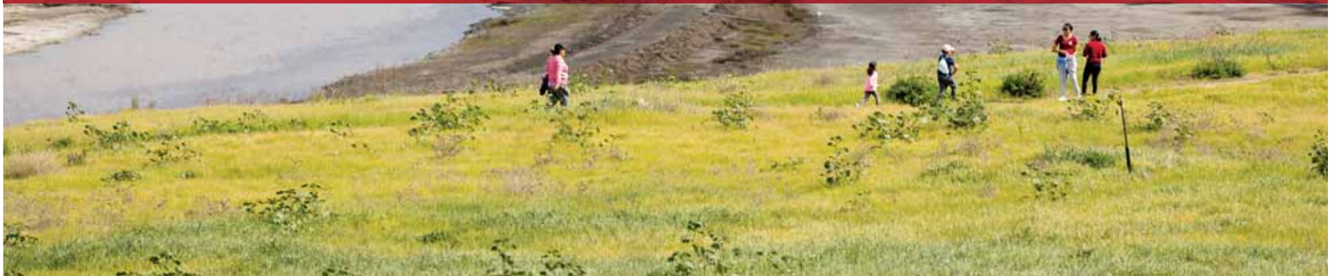
A group of people walk around Bedwell Bayfront Park by a very empty Bayfront Expressway in Menlo Park on March 19.

HOW YOUR NEIGHBORS, BUSINESSES AND PUBLIC AGENCIES ARE CARRYING ON WITH LIFE IN THE FACE OF THE CORONAVIRUS THREAT