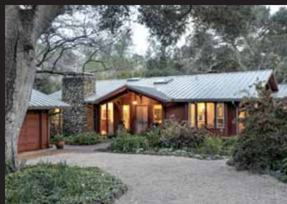
4 Stowe Court, Menlo Park 4 Bed | 2.5 Bath | $3,950,000 4stowecourt.com

Genella Williamson 650.787.0839 DRE 00755754