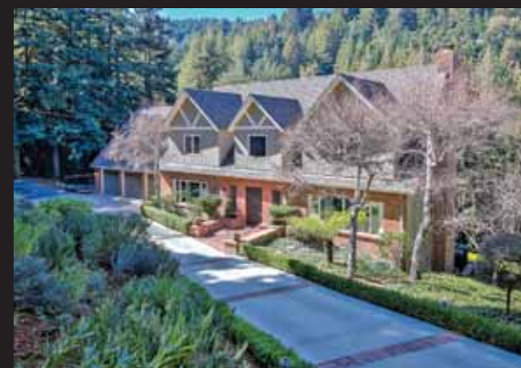
850 Patrol Road, Woodside 3 Bed | 3.5 Bath | $4,295,000 850patrol.com

Margot Lockwood 650.400.2528 DRE 0017519