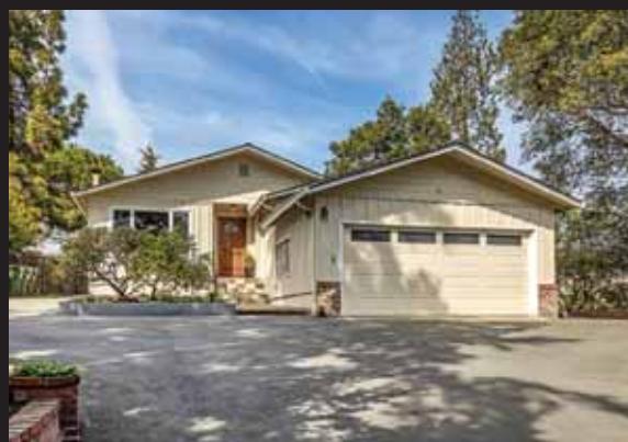
111 Alta Mesa Road, Woodside 4 Bed | 3 Bath | $2,695,000 111altamesa.com

Deborah Kehrberg 650.888.6558 DRE 01131900