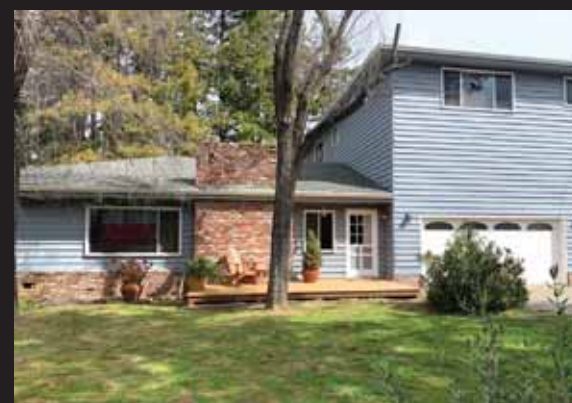
15 Corto Lane, Woodside 5 Bed | 2.5 Bath | $3,195,000 15corto.com

Margot Lockwood 650.400.2528 DRE 01017519