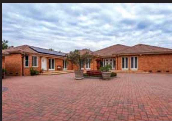
742 Crestview Drive, San Carlos 4 Bed | 4.5 Bath | $4,150,000 742crestview.com

Genella Williamson 650.787.0839 DRE 00755754