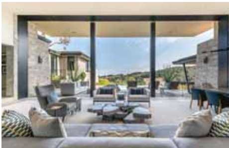
3 Redberry Ridge, Portola Valley Offered at $15,995,000 The Campi Group · 650.917.2433 Lic #00600311