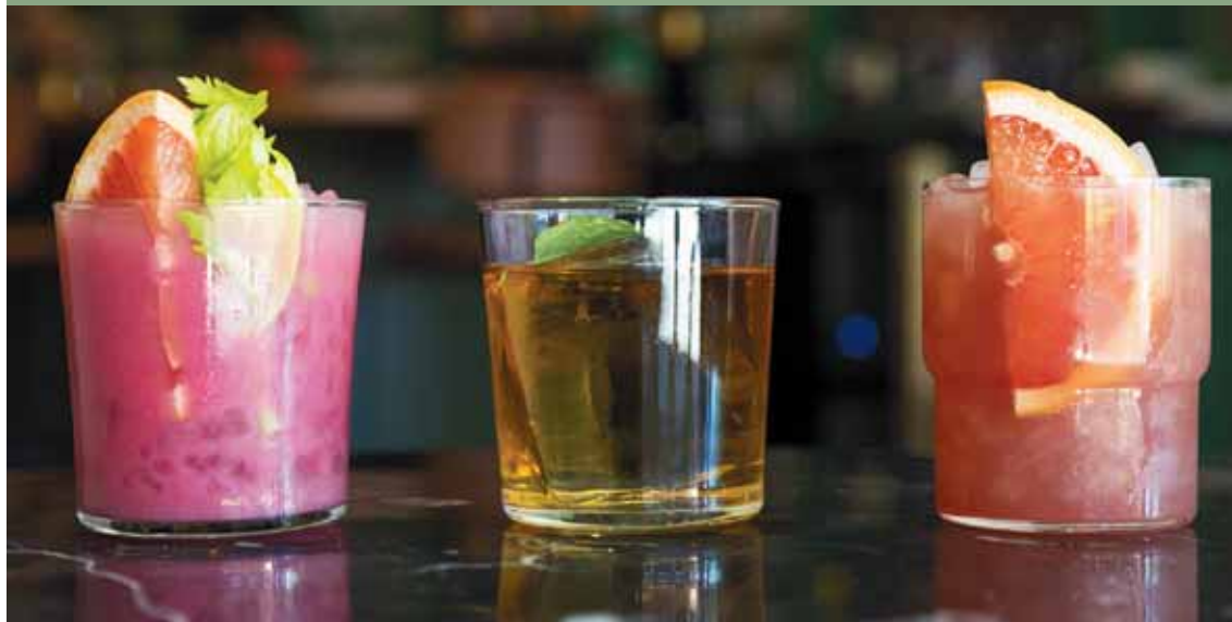
Bar Zola's Speak Low, Rude Boy and Weekend in Tulum cocktails.