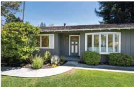
1189 S. Springer Road, Los Altos Offered at $2,895,000 The Campi Group · 650.917.2433 Lic #00600311