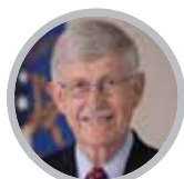
Francis Collins, MD, PhD Director, National Institutes of Health