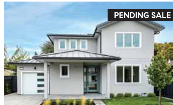
715 Partridge Avenue, Menlo Park $3,129,000 | 4 beds, 3.5 baths