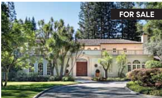
70 Linda Vista Avenue, Atherton $12,988,000 | 5 beds, 4.5 baths, guest house 70LindaVista.com