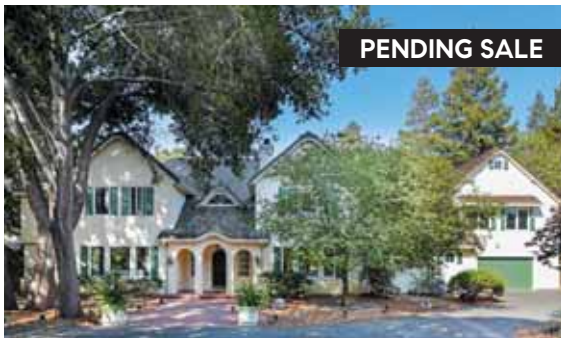
935 Menlo Oaks Drive, Menlo Park $5,950,000 | 6 beds, office, 4.5 baths