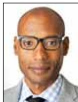
Mayor Drew Combs

Normally, the city manager and mayor set meeting agendas together, and traditionally, all council members are polled