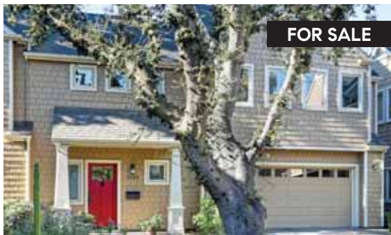
1425 San Antonio Avenue, Menlo Park $2,125,000 | 3 beds, 2.5 baths, 1425SanAntonio.com