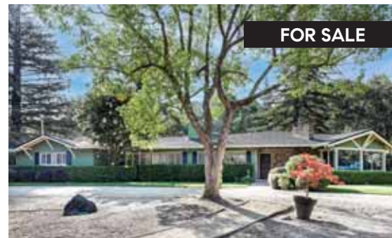
497 Stockbridge Avenue, Atherton $6,495,000 | 2 beds, 3.5 baths, guest house, pool house, 497Stockbridge.com