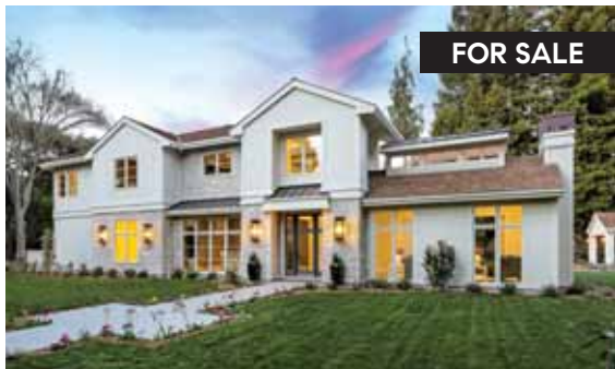
289 Almedral Avenue, Atherton $17,995,000 | 5 beds, office, 6+ baths 289Almedral.com