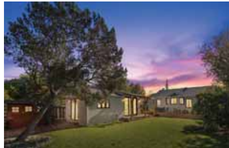
437 Jeter St, Redwood City OFFERED AT $1,850,000 BEDBURY GROUP 650.740.4494 · LIC. #01817656