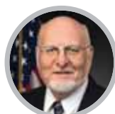
Robert Redfield, MD Former Director, Centers for Disease Control and Prevention