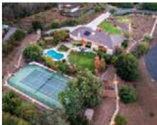
24595 Voorhees Dr