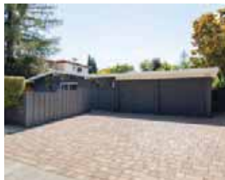
875 Rorke Way