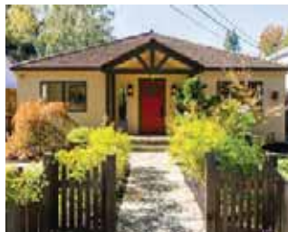
263 Yale Rd