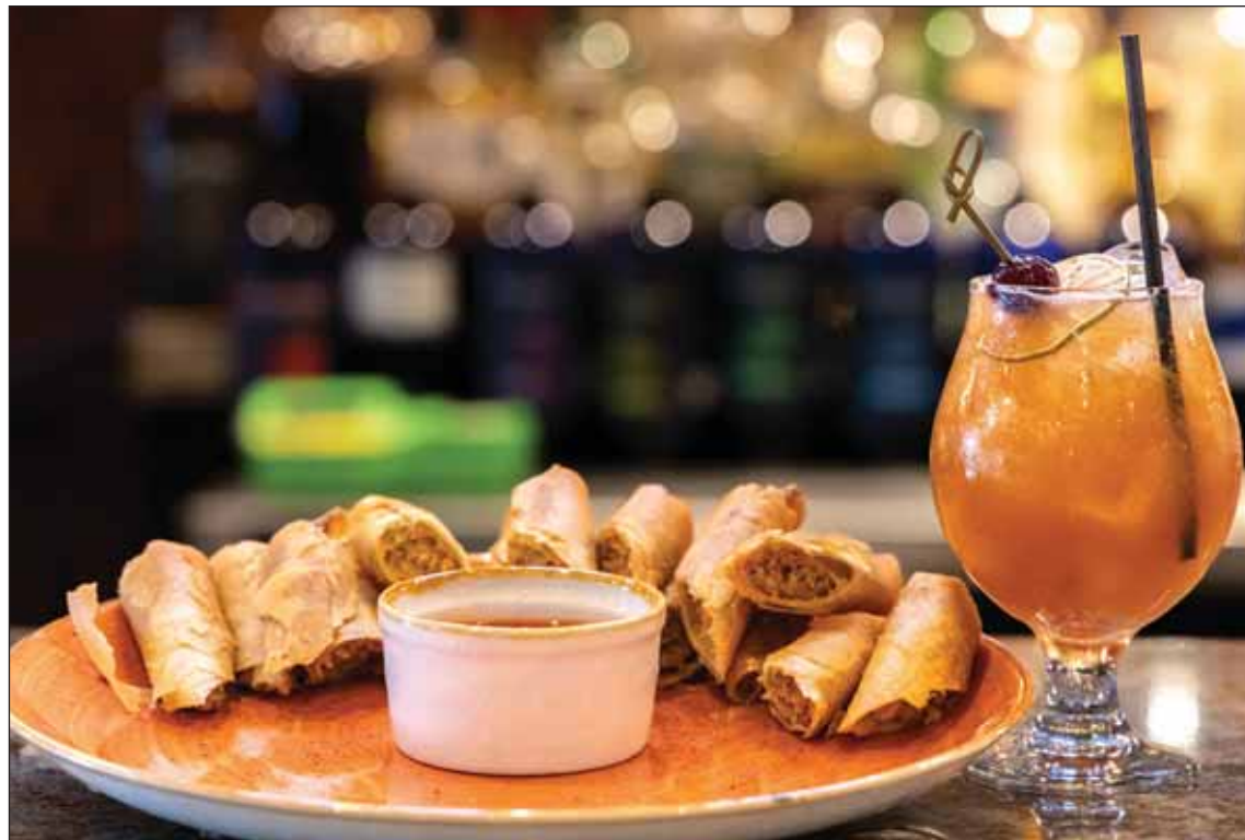
The food and drink options at San Mateo's Avenida are robust with Filipino flavors, including appetizers like Lumpiang Shanghai and a Pinoy Punch cocktail.

LV Mar is a modern and comfortably upscale Latin restaurant