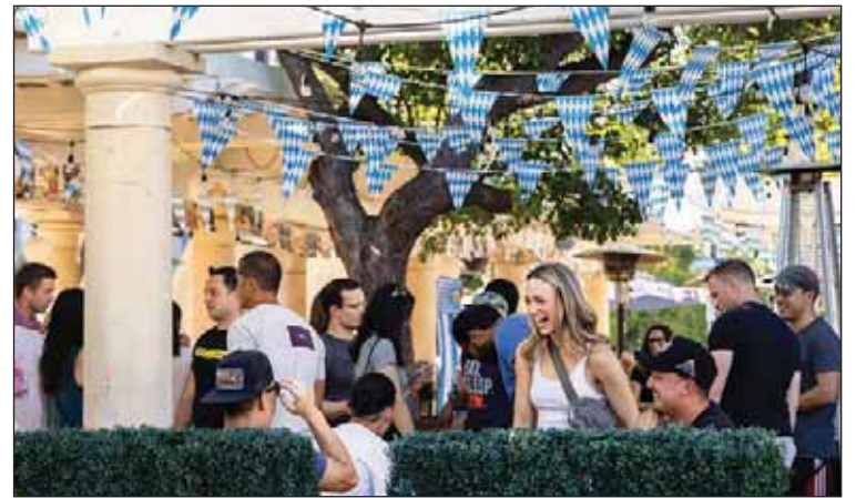
The patio at Ludwig's Biergarten in Mountain View is typically bustling during happy hour.