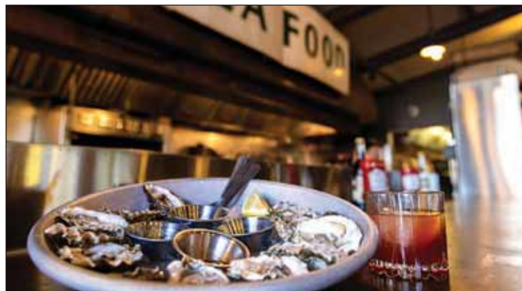
San Carlos' Rustic House Oyster Bar and Grill serves up a variety of seafood. Among happy hour offerings are oysters, of course, and discounted menu cocktails that include a Blackberry Old Fashioned, one of the eatery's most popular drinks.

They offer a notable amount of local beers on draft alongside wines by the glass and well drinks. I went for my go-to in these situations, Drake's 1500 Pale Ale, and paired it with the chicken souvlaki skewers. The owner is Greek and offers a menu with a Mediterranean flair. The chicken skewers were cooked to garlicky perfection