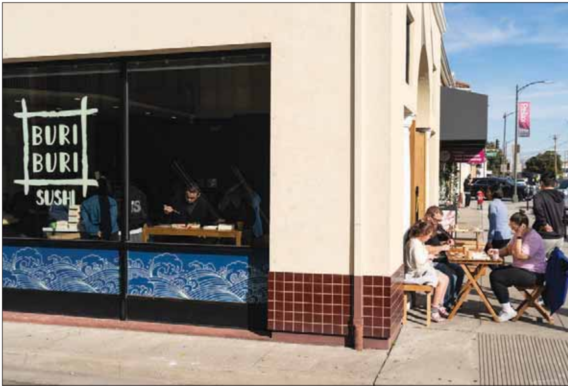
Customers eat inside and outside Buri Buri in Burlingame on Jan. 17.

offers specialty rolls, nigiri, inari (a sweet-and-savory tofu pouch) and pressed sushi, with everything priced at $2.35-$3.25 per piece.