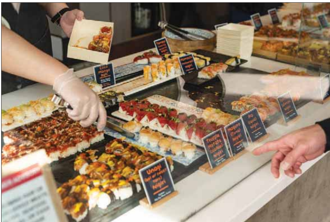
A customer points out nigiri to add to their order at Buri Buri in Burlingame on Jan. 17.