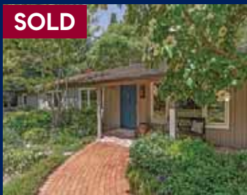
3 Wyndham Dr, Portola Valley