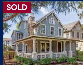
207 Pearl Ln, Menlo Park