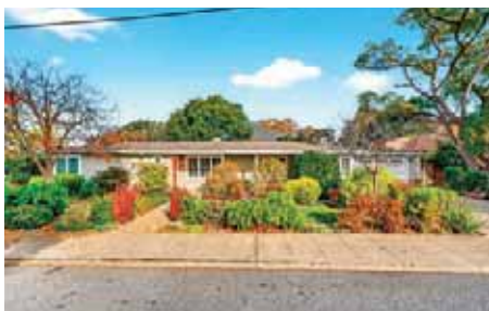
1621 Elm Street, San Carlos OFFERED AT $2,695,000

CARRIE DU BOIS 650.766.9069 LICENSE# 01179769