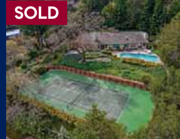
370 Atherton Ave, Atherton