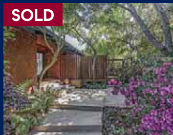
300 Cervantes Rd, Portola Valley