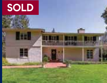
55 Serrano Dr, Atherton