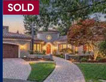
8 Reyna Pl, Menlo Park