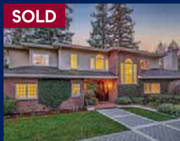
87 Fair Oaks Ln, Atherton