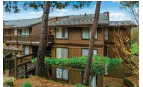
3387 Brittan Avenue #2, San Carlos OFFERED AT $749,000

JESSICA EVA 650.704.5483 LICENSE# 01210450