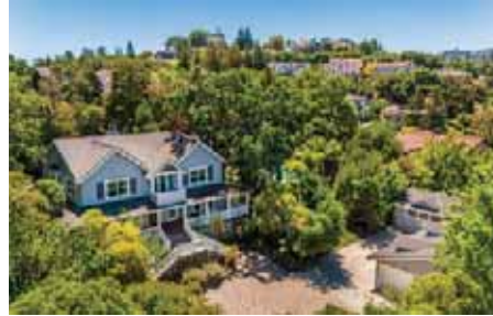
1353 Edgewood Road, Redwood City OFFERED AT $5,695,000

RICKY FLORES 408.565.5626 LICENSE# 02027985 MARGOT LOCKWOOD 650.400.2528 LICENSE# 01017519