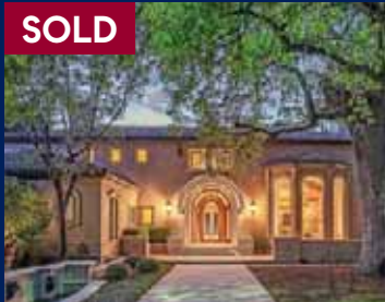
250 Atherton Ave, Atherton