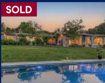
275 Eleanor Dr, Woodside