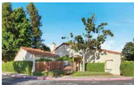
142 Mission Drive, East Palo Alto OFFERED AT $899,000

KATHRYN BEDBURY 650.740.4494 LICENSE# 01817656