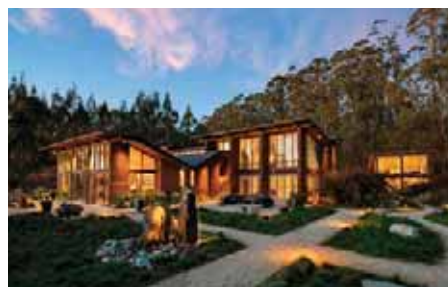
2050 Green Oaks Way, Pescadero OFFERED AT $5,995,000

TOM MARTIN 408.314.2830 LICENSE# 01272381