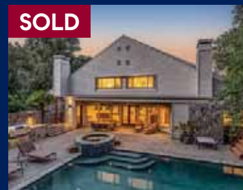
3 Oak Forest Ct, Portola Valley