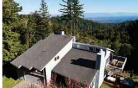
255 Allen Road, Woodside OFFERED AT $2,395,000

OMAR KINAAN 650.776.2828 LICENSE# 01723115