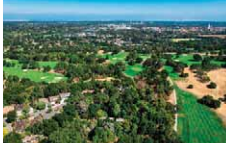
25 Stowe Lane, Menlo Park OFFERED AT $11,000,000