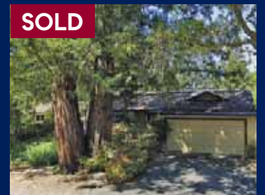
243 Echo Ln, Portola Valley*