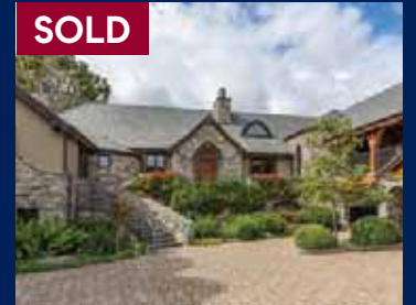
220 Golden Hills Dr, Portola Valley