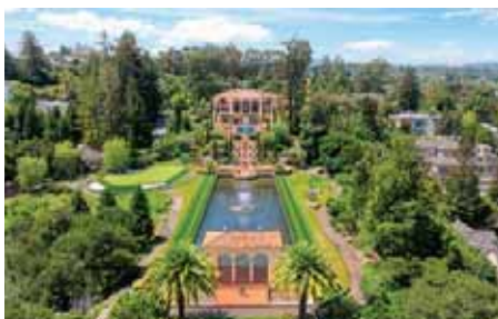
3000 Ralston Avenue, Hillsborough OFFERED AT $88,000,000

KELLY RADETICH 650.303.9589 LICENSE# 01229022