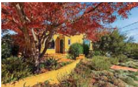
418 Ridge Road, San Carlos OFFERED AT $2,690,000

CARRIE DU BOIS 650.766.9069 LICENSE# 01179769