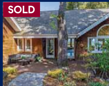
1144 Los Trancos Rd, Portola Valley