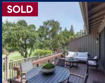
410 Sand Hill Cir, Menlo Park