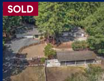
3570 Tripp Rd, Woodside