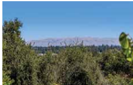
941 High Road, Woodside OFFERED AT $4,995,000

JIM MINKEY 650.576.1732 LICENSE# 01073312