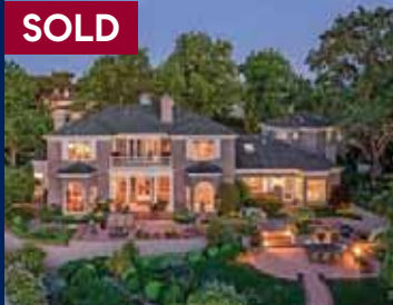
1205 Trinity Dr, Menlo Park