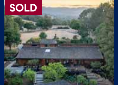
6 Arastradero Rd, Portola Valley