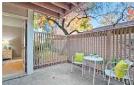
280 Easy Street #403, Mountain View OFFERED AT $550,000

JEFFREY KOCKOS 650.430.8587 LICENSE# 01822441