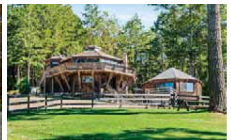
200 South Ranch Road, Pescadero OFFERED AT $1,950,000

JAKKI HARLAN 650.465.2180 LICENSE# 01407129