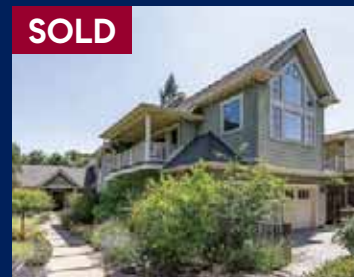
587 Sequoia Ave, Redwood City