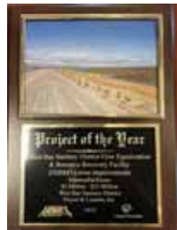
Project of the Year Award

The Levee Improvement Project was supported by a $4 million grant from the National Fish and Wildlife Foundation (NFWF). This funding made it possible for the District to strengthen essential infrastructure while protecting nearby wetlands and wildlife habitat.