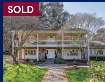
22 Oakwood Blvd, Atherton