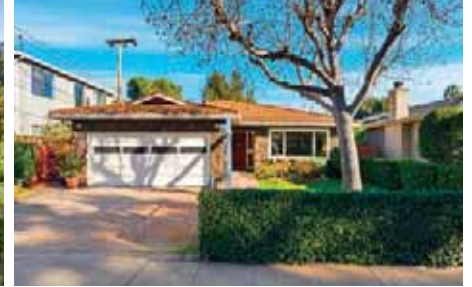
255 East Oakwood Boulevard, Redwood City OFFERED AT $2,095,000

JOHN SHROYER 650.787.2121 LICENSE# 00613370