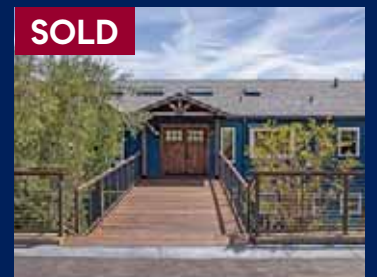
83 Tum Suden Way, Woodside