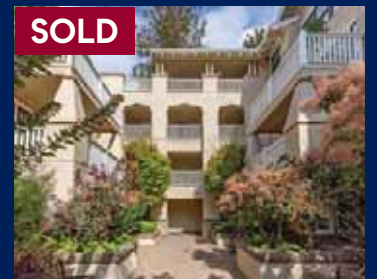
315 Homer Ave #105, Palo Alto

ATHERTON MENLO PARK PORTOLA VALLEY WOODSIDE