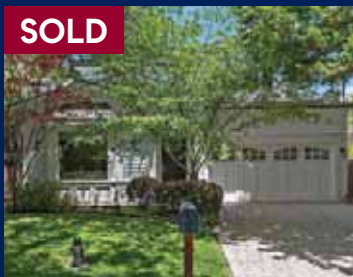
1260 Sherman Ave, Menlo Park*